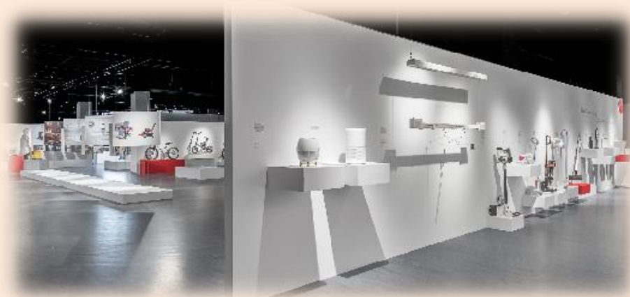
Contemporary Good Design Exhibition

Before starting my internship, I had enhanced my English speaking skills, typing skills and the comprehension ability of several working software, such as Word, Excel and PowerPoint, etc. When I first came to the museum, my manager talked with me and solved my confusion in about 30 minutes. This talk includes the future plan that I need to do during my internship and the main purpose of Red Dot Design Museum. After the talk, I need to be familiar with each exhibition so I was told to walk around and recognize each awarded entries. Since 2020 Contemporary Good Design Award (abbreviated as CGD) had come to an end, Red Dot Design Museum had held several exhibitions to display the marvellous awarded entries. On the first floor, we had the CGD exhibition, which separated into four zones. Life zone, Work zone and Entertainment zone were included. On the second floor, we had the Elements of design exhibition. It included the Best of the Best entries, which revealed the most outstanding designs in this competition.