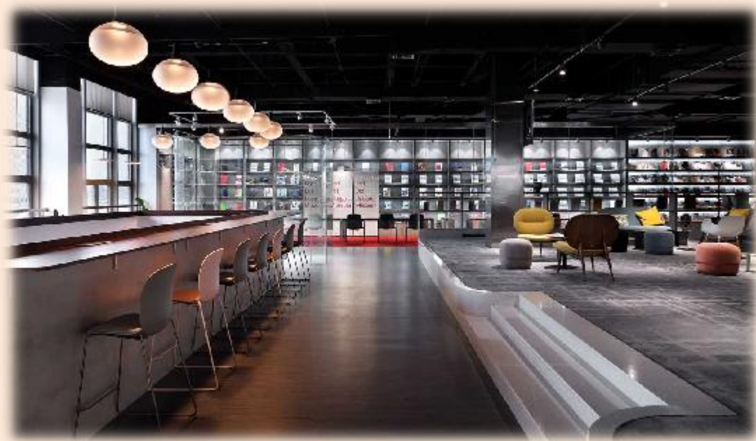
SPACE area for visitors to take break

Lastly, I can accumulate my work experience. Communicated with costumers and colleagues and wrote formal business emails and etc. It is different from my school's learning.