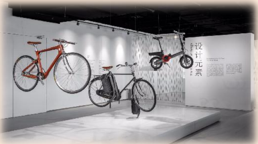
Elements of Design Exhibition